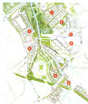
LEGACY MASTERPLAN 1 Chobham Manor 2 East Wick 3 Sweetwater 4 Marshgate Wharf 5 Pudding Mill 6 Athletes' Village 7 Stratford 8 International 9 Westfield 10 Stratford City

Three new schools – two primary and a secondary – will support the neighbourhoods and the surrounding area along with Chobham Academy, which sits just next to the Olympic Village and will open in September 2013. Other amenities include nine nurseries, three health centres and 12 multi-purpose community spaces, which could be community centres, libraries and gyms.