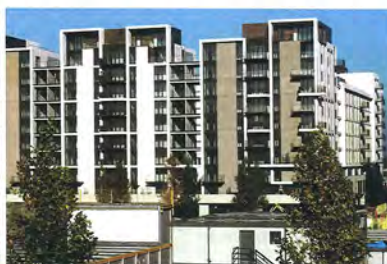
13. N26 by DRMM