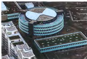
9. Chobham Academy by AJHM

A question of scale This compromised, convoluted history is very much in evidence on the streets of the Athletes' Village