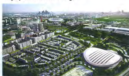
Chobham Manor will be the first legacy community to be developed.

The Olympic Legacy Communities Scheme, submitted for planning in September 2011, covers 64ha of the park where five new neighbourhoods are to be built over the next 20 years: Chobham Manor, East Wick, Sweetwater, Marshgate Wharf and Pudding Mill.