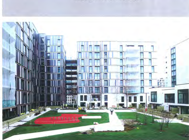
DRMM's plot N26 features extruded, ceramic-clad blocks facing on to low-rise mews housing to the east of the site.

mineral quality. Layers of upering balconies form fanned craps across its facade, positioned in response to the planned 30-storey tower by Ian Simpson across the way – one of the more ambitious proposals, along with Make's twin towers, which have not materialised.