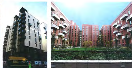
11. N14 by Lifschutz Davidson Sandilands