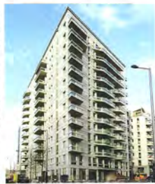
1. N8 by DSOMA