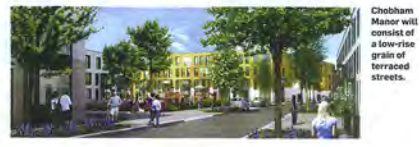
Chobham Manor will consist of a low-rise grain of terraced streets.

the Athletes' Village to form a "metropolitan gateway" to the park. A large proportion of the ground floors will be given over to waterside shops, restaurants and cafés, catering to the area's role as a visitor destination. Pudding Mill, sited at the confluence of rivers and canals to the south of the park, Pudding Mill has an industrial character and is made up of irregular parcels of land framed by rail lines, viaducts and underpasses. Development will provide a range of unit types, balancing the demands of the residential population with those of its creative and industrial uses.