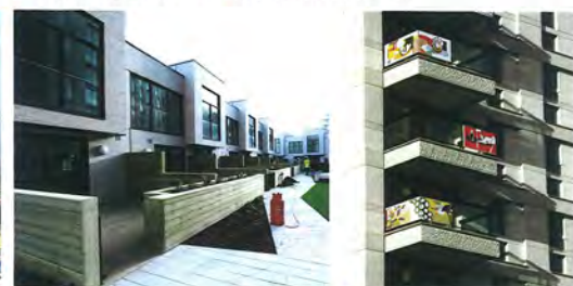
13. N26 by DRMM